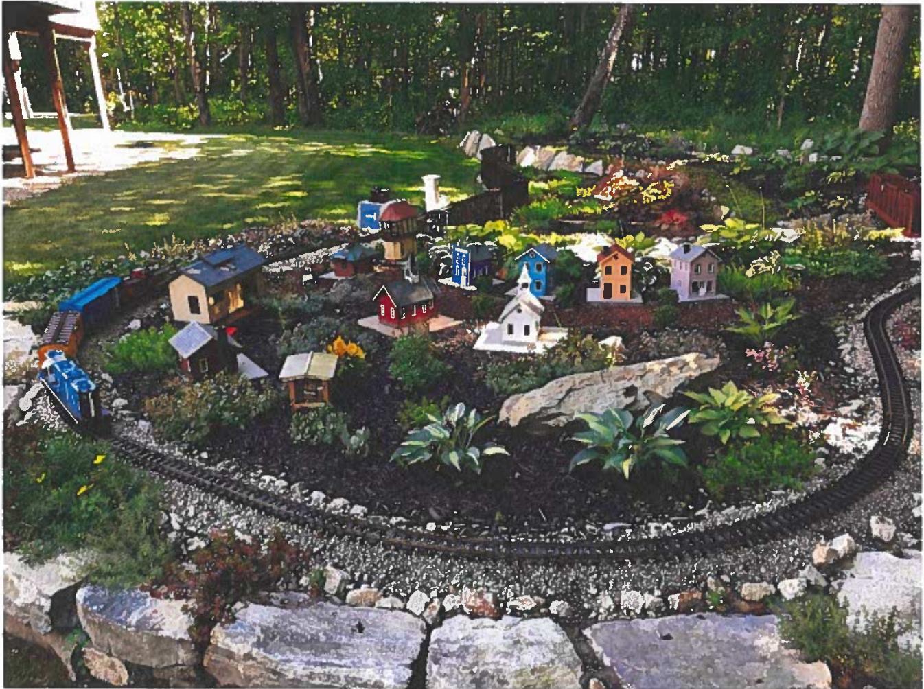
BACKGROUND GARDEN SCALE ("G SCALE") RAILROAD

Problems he ran into you may ask? Deer and turkey- He lost 31 hostas last winter/spring.