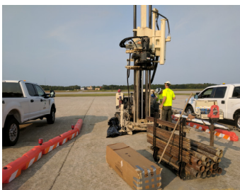
A mobile drilling rig will be used to install monitoring wells.

monitoring wells: You may see members of our team at a number of locations working with a drill rig, installing monitoring wells. Collection of approximately 80 groundwater samples are planned.