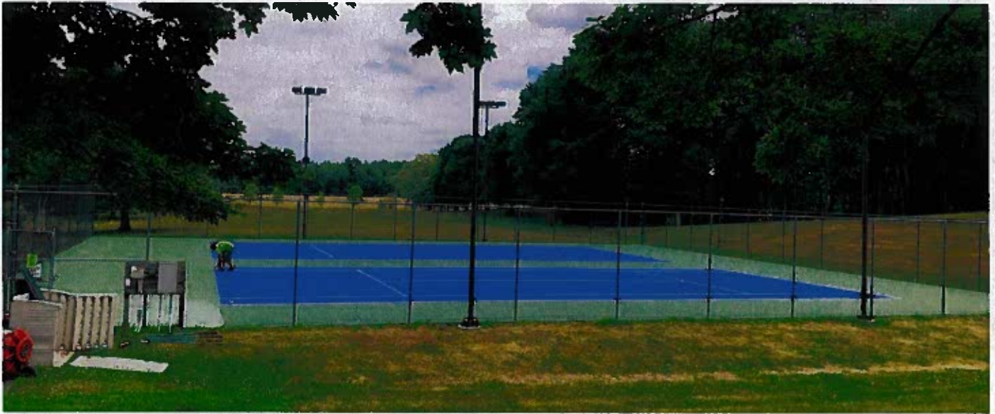
Final Touches Being Put on the Resurfaced Tennis Courts- They Re-open August 1st