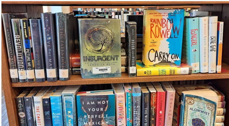
Young Adult Fiction