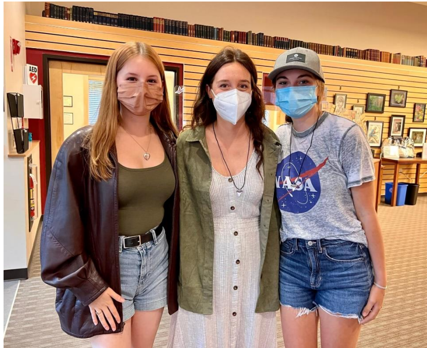
From the Summer Reading Finale Party, August 9: