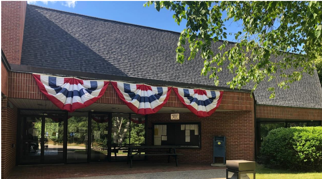
Town Hall All Decked Out for Fourth of July!