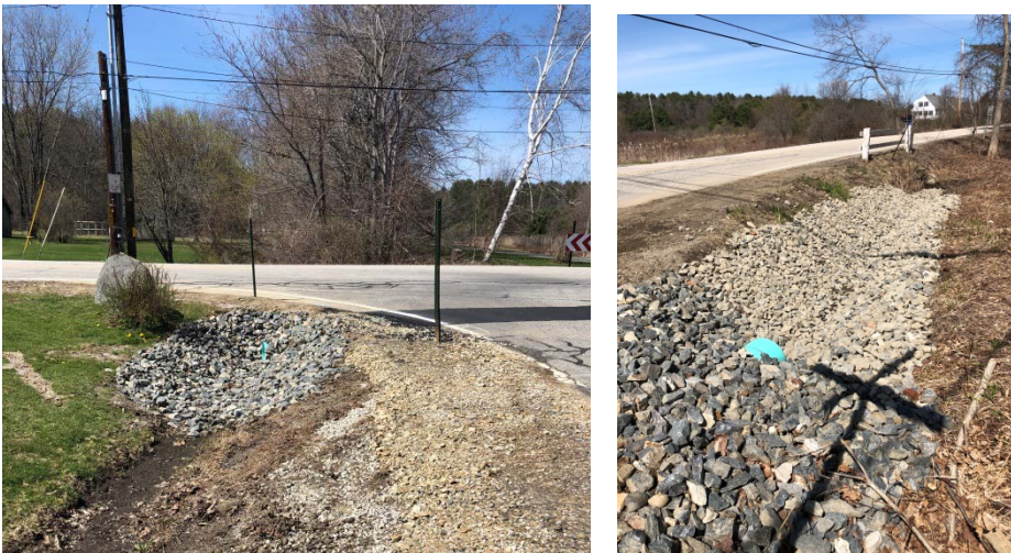
McIntyre Road Drainage project- view looking towards Little Bay Road

Drainage Projects: A drainage study was completed in 2019 which identified 3 critical condition projects that had to be repaired immediately. One, Little Bay Extension was completed in the fall of 2019. The two remaining projects on McIntyre Road and Fox Point Road were completed this month.