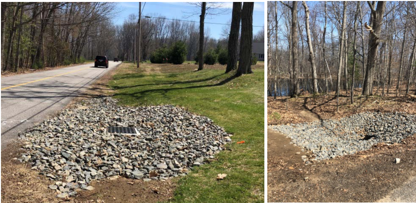
Fox Point Drainage Repair Project by Clam Shell Pond