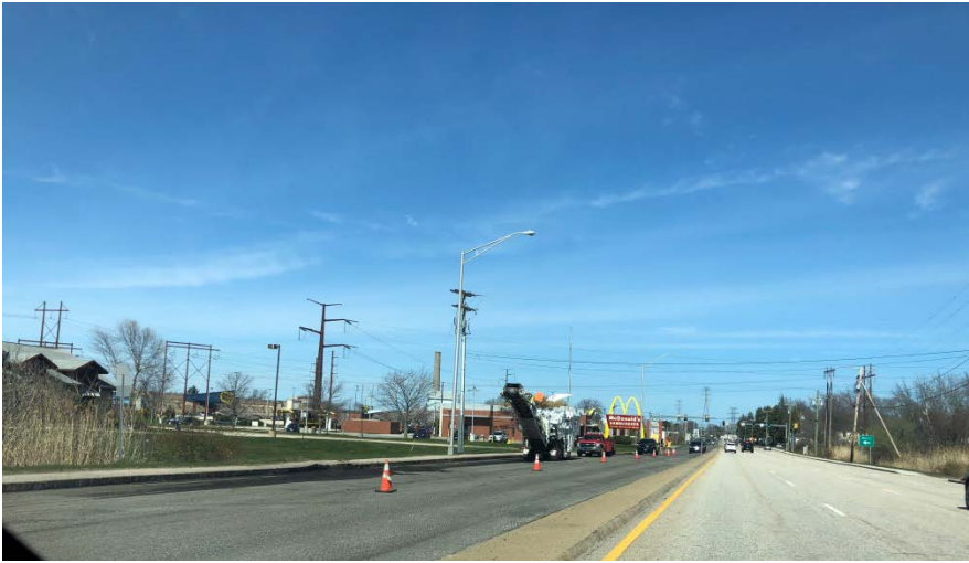
Milling and paving of Gosling Road underway

Drainage Projects: A drainage study was completed in 2019 which identified 3 critical condition projects that had to be repaired immediately. One, Little Bay Extension was completed in the fall of 2019. The two remaining projects on McIntyre Road and Fox Point Road were completed this month.