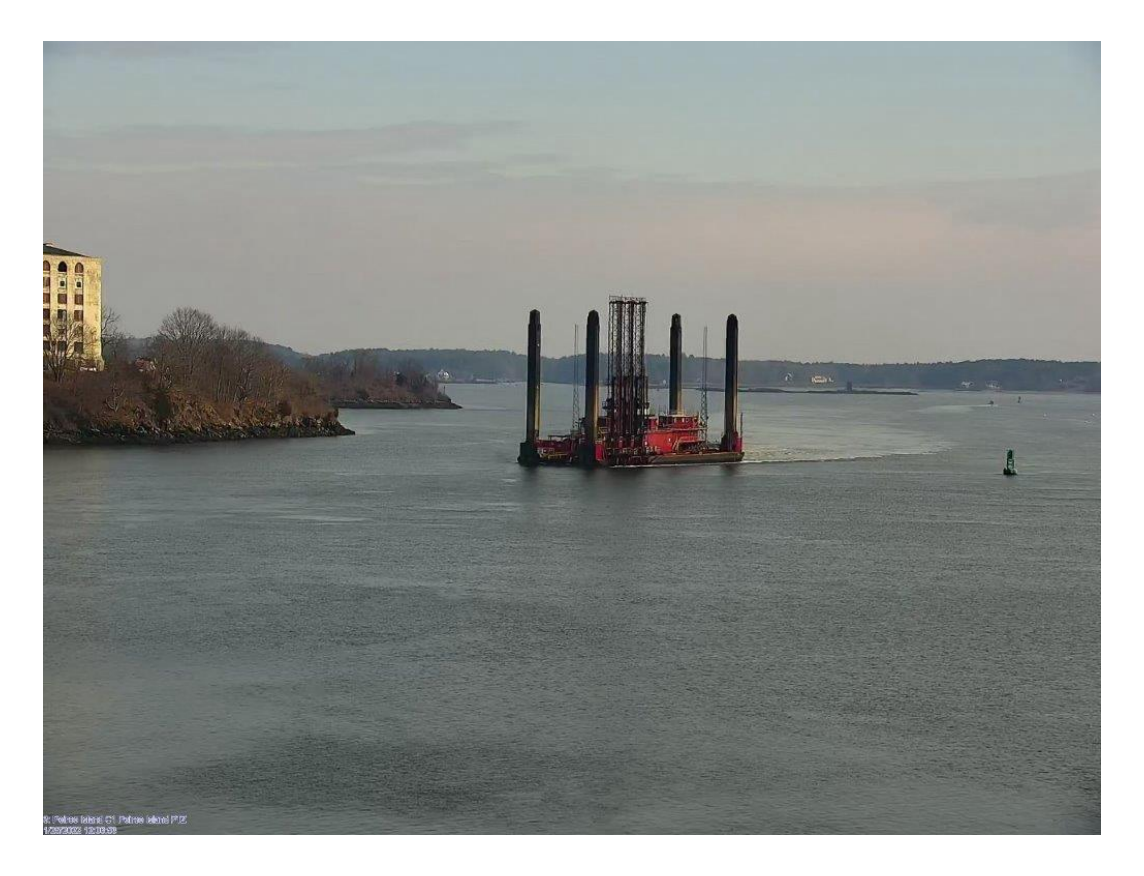
Drillboat "Apache" on its way to the Piscataqua turning basin widening project -heading to Newington

Drillboats are used to fragment rock into smaller pieces using explosives. The rock pieces are then removed by bucket or cutter suction dredges. It is 210 feet long x 60 feet wide x 90 feet tall