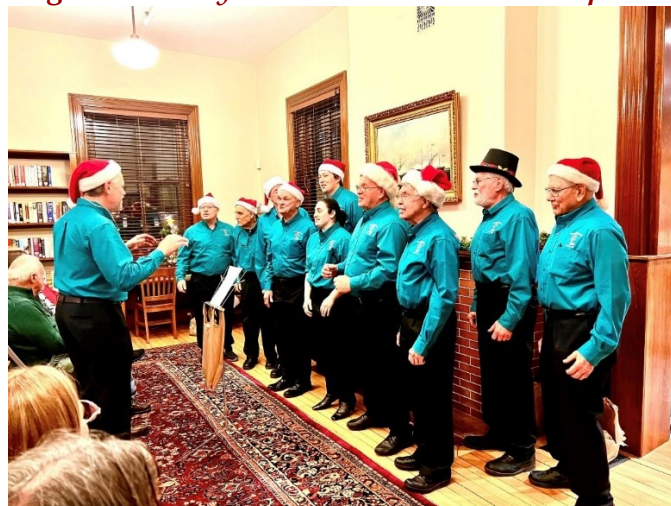
Seacoast Men of Harmony, Musical Performance