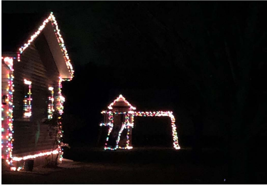
Playset Christmas lights- Boston Family, Fox Point Road